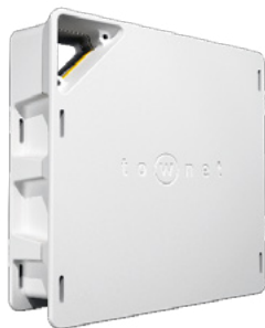
Performance and endurance