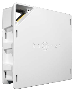
Performance and endurance