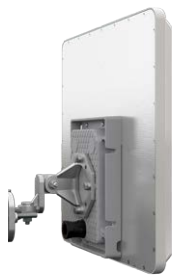
orientable mounting kit