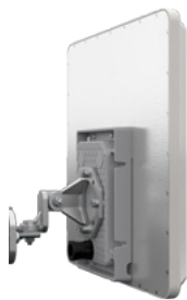
orientable mounting kit